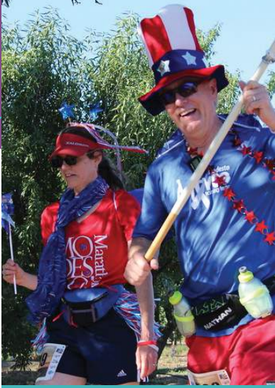
Runners at our 2019 5k