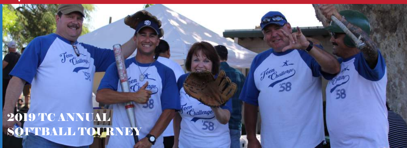
2019 TC ANNUAL SOFTBALL TOURNEY